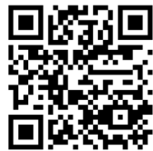
NetBenefits® for iPad®